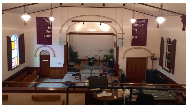
Sanctuary & Platform - Before